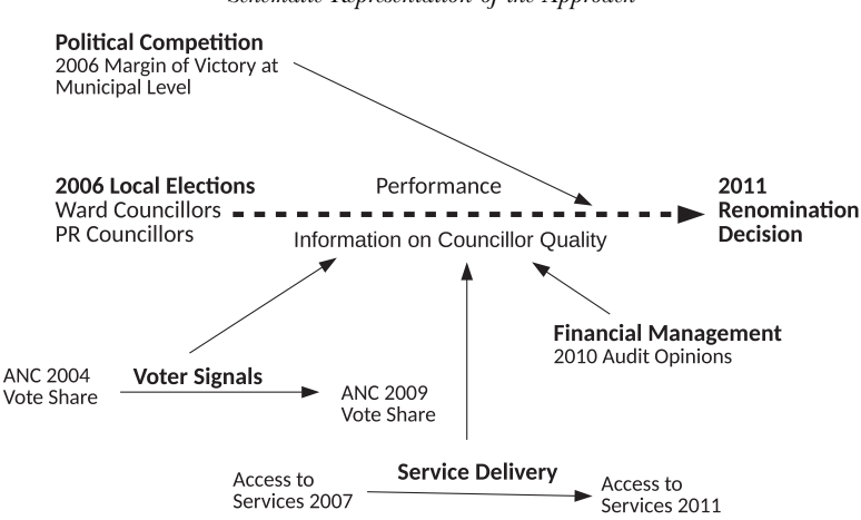
Figure 1 Schematic Representation of the Approach

this study. To the contrary: to find that councillor performance has an effect on renomination would be an even more important signal of responsiveness to voters in view of such a countervailing force.